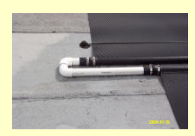
Example of series flow that should be avoided

Note that the feed pipe should be taken to the far lower corner of the panel bank so that the return pipe is shorter going back to the pool thus reducing heat loss.