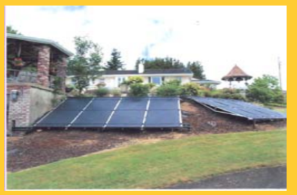
Eight 4x12 FRFCO SunSaver panels on GroundPro aluminum racks

master distributor for FRFCO Solar Pool Heating Systems for the Pacific NW, Hawaii, and several mountain states with 28 years of experience. Our interest is to help our dealers and their customers design and install solar systems that will perform well and provide 20+ years of trouble-free operation.