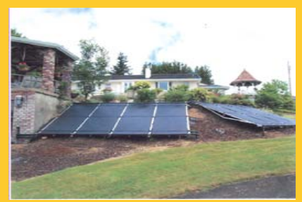
Eight 4x12 FRFCO SunSaver panels on GroundPro aluminum racks

master distributor for FRFCO Solar Pool Heating Systems for the Pacific NW, Hawaii, and several mountain states with 28 years of experience. Our interest is to help our dealers and you, their customer, design and install solar systems that will perform well and give 20+ years of trouble-free operation.